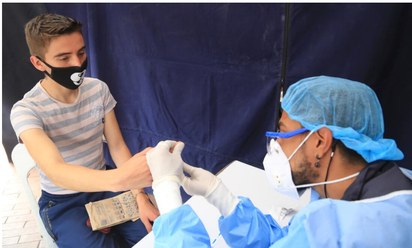
Photo: With the support of the Global Fund, an app called TeCuidamos.com offers quick access to HIV diagnosis in Colombia. It also provides prevention and counselling to men who have sex with men, transgender people, and sex workers.

According to senior officials at the health centre, early and ongoing engagement with key populations has enabled the hospital to build trust with communities, which in turn helps increase demand for health services. Key informants particularly highlighted the critical value of community-led monitoring initiatives in providing input to improve the quality and accessibility of HIV and other health services in Colombia.