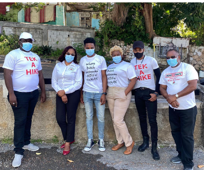
Photo: Jamaica AIDS Support for Life (JASL) staff. Kingston, Jamaica, January 2022. JASL.

In 2020, the Government of Jamaica launched the 'Vision for Health 2030', a ten-year strategy to reform and improve its health system (32). In particular, Jamaica is prioritizing efforts to address both noncommunicable and communicable diseases and to improve maternal and child health, with a specific focus on strengthening primary care (33). In addition, Jamaica has launched an effort to roll out national health insurance to ensure universal health coverage (34). As part of its effort to transform its health system, Jamaica has launched a health systems strengthening project focused on its pilot phase on strengthening primary care in 11 primary health centres and three hospitals (31).