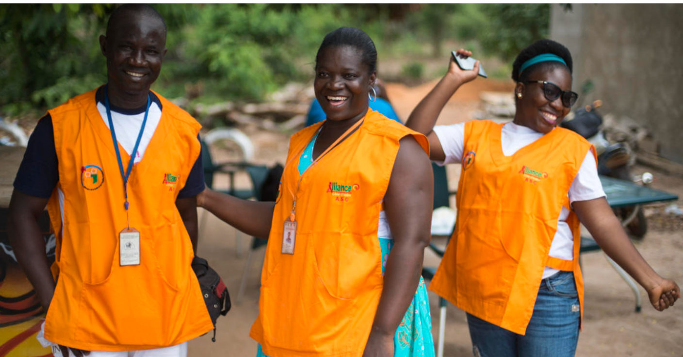
Photo: Educators from Alliance Côte d'Ivoire conduct an HIV information and prevention campaign at a transport hub for buses, taxis and trucks. Toumodi, Côte d'Ivoire.

The health system in Côte d'Ivoire has three tiers – primary care through urban and rural health centres and dispensaries, regional hospitals capable of offering both primary care and more complex interventions, and a tertiary level where specialized care is available (25). The national health system suffers from a shortage of health professionals, although the country has one of the strongest health data systems in the region (25).